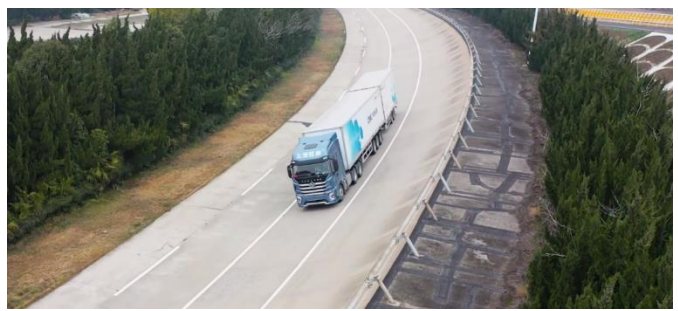
Figure 7– Power Performance Test Picture

The tractor vehicle was equipped with a 560 horsepower engine, and the dual-trailer road train could achieve a maximum slope climbing and starting ability of 16.6%, and could reach a maximum speed of 116.72 km/h under full load. The test was repeated with the same tractor with a standard semitrailer. It reached a maximum speed of 117.11 km/h. It can be seen that the maximum speed of a dual-trailer road train is equivalent to that of one semi-trailer combination.