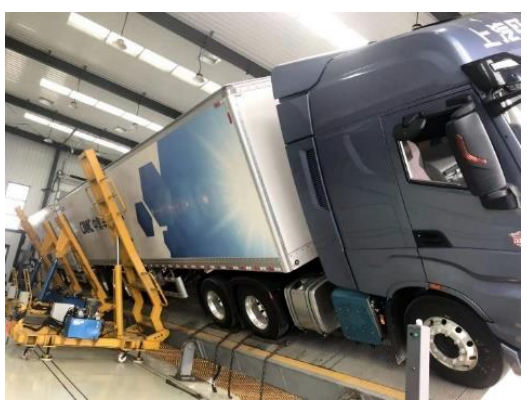
Figure 5 – roll stability test Picture

The road train was subjected to an un-loaded roll stability test in accordance with the requirements of the "Static Roll Stability Bench Test Method for Cars, Trailers, and Car Trains" (GB/T 14172-2021). When the roll reached 35 °, the tires of the towing vehicle and trailer did not detach from the test bench, and the force on the tire support surface is not zero, indicating that the dual-trailer road train has good roll stability.