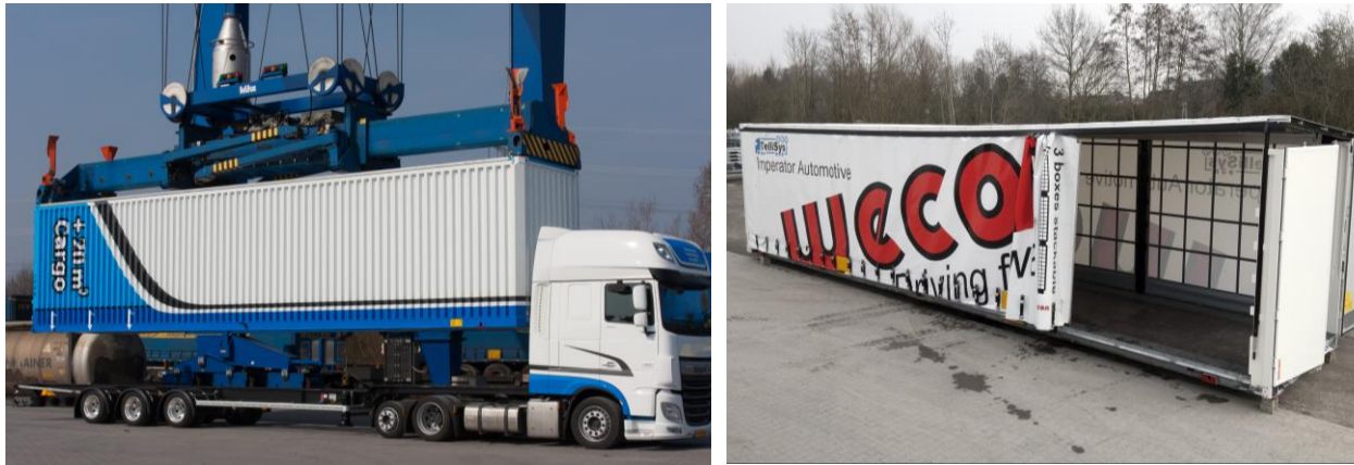
Figure 1: a) TelliSys system during handling operations b) Automotive loading unit.

suitable chassis that enables the transport of the new loading units during pre and post carriage (cf. Figure 1). After analysing current loading units and in response to the wide variety of market requirements [8, 9], a number of different loading units have been defined for different use cases.