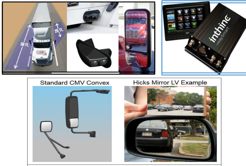
Figure 2 – Clockwise from top, BSW technology used (“SideEyes” by Novita Technologies (ISO 17387, Type I); OBMS technology used (waySmart™ by inthinc®); Novel mirror technology used (“Hick’s Mirror”)