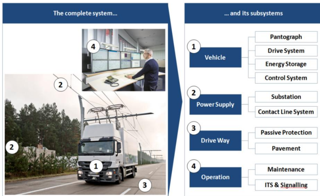
Figure 1 - The OCL-ERS and its Sub-Systems.

Similarly to typical electrical traffic systems the OCL-ERS comprises of four sub-systems: the electrical vehicle/truck, the traction power supply and distribution, the roadway and an operation control center, see Figure 1. The following sections describe these sub-systems in further detail.