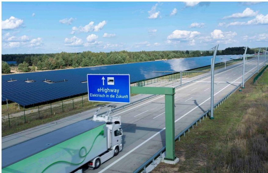
Figure 3 – New Test Facility

The evaluation process helped to identify all relevant aspects to be considered for integration of the OCL-ERS infrastructure in public roads. Based on these findings design guidelines were derived. Furthermore the test facility was enhanced and now includes a curved section as well as additional infrastructure typical for German highways, such as road signs and gantries, see Fehler! Verweisquelle konnte nicht gefunden werden.