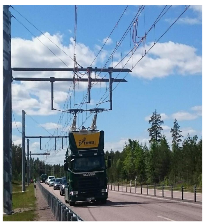
Figure 3 - The Siemens e-Highway system demonstrated outside Sandviken in Sweden.

The length of the whole process, from designing the procurement until the ending of the demonstrations, will be almost 6 years. The budget is approximately 200 MSEK (20 MEuro) with public funding of 125 MSEK. The result so far is that two systems are being demonstrated, each with a length of 2 kilometers; the Siemens e-Highway conductive system (current through hanging lines) demonstrated by Gävleborg region together with Scania outside the town Sandviken, and the Elways conductive system (current through a beam in the road) demonstrated outside Arlanda international airport.