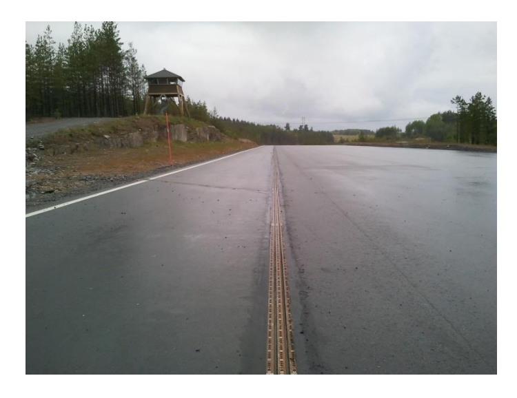
Figure 4 - The Elways electric beam on a test site.