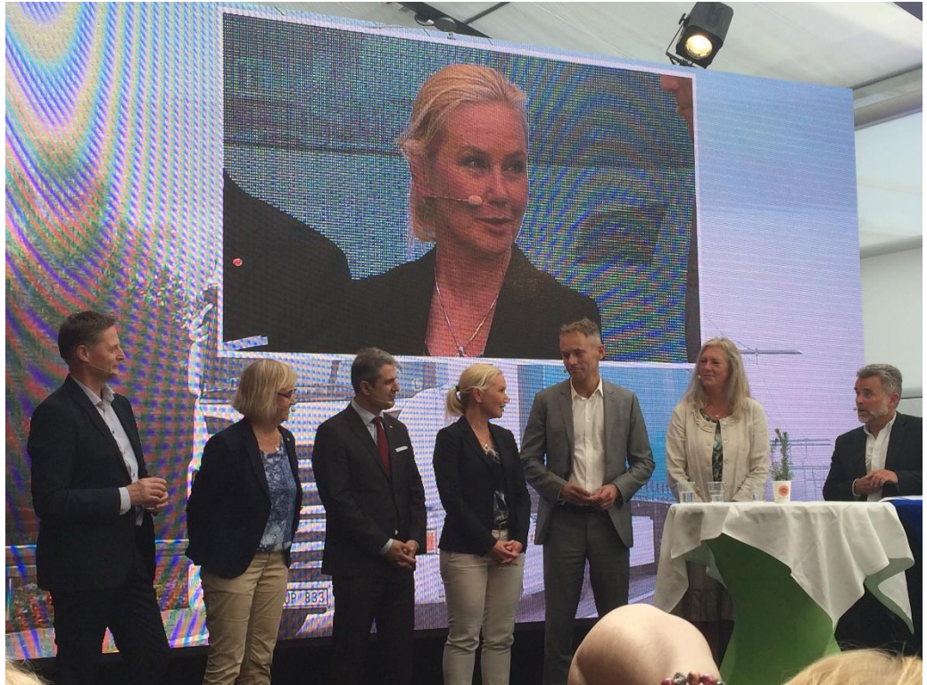
Figure 5 – Pleased ministers and director generals at the opening of the Sandviken demonstrator.

In June 22 the Siemens system outside Sandviken was opened by the Swedish ministers of energy and infrastructure together with the director generals of STA and the energy agency. This is still, to our knowledge, the first ERS system for long haul freight transport on public roads.