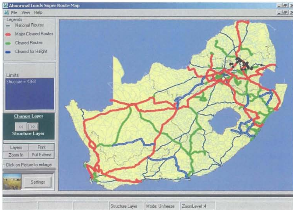
Figure 3 Super Route map showing structure information