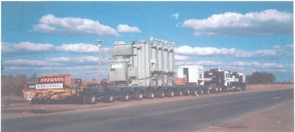
Figure 1 Typical medium-sized superload motorised by two haulers